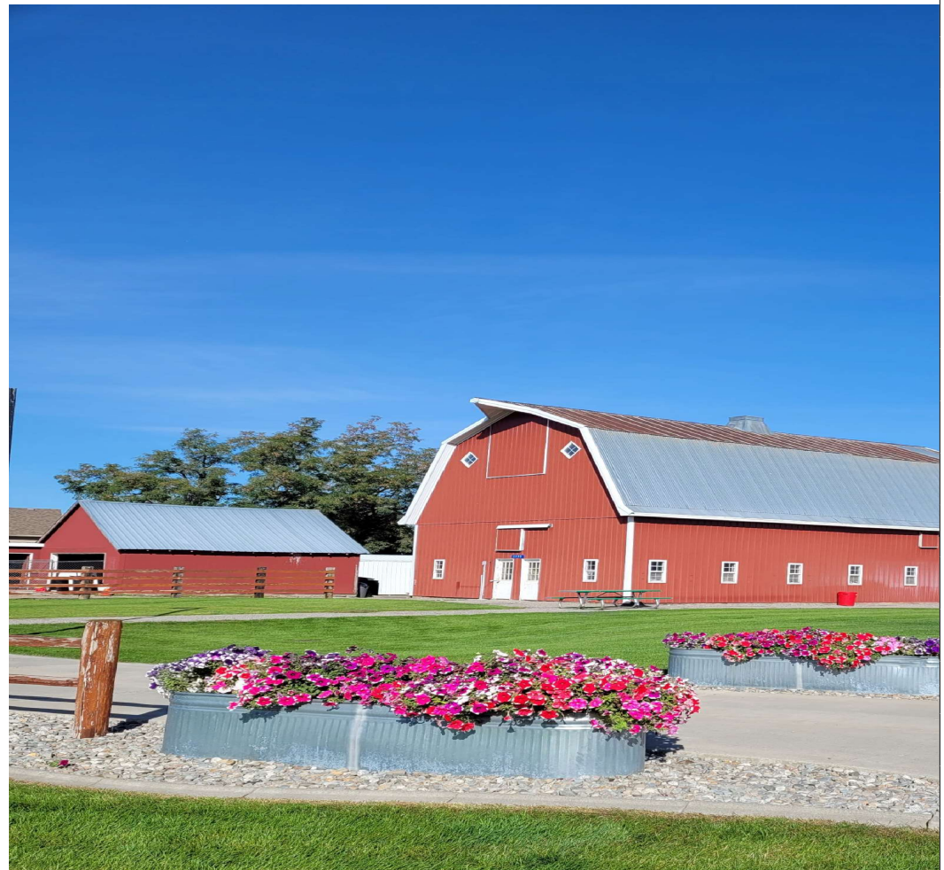
Big red barn on Prairie Ave. as seen on a beautiful summer morning.