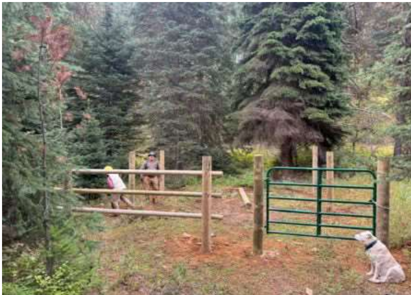
Photos of the corrals construction at Line Creek campground by Susan Walker.

Drive 29 miles east of Avery on St. Joe River Road (Forest Highway 50), turn south on Red Ives Road (#218) and proceed 11 miles to the campground entrance.