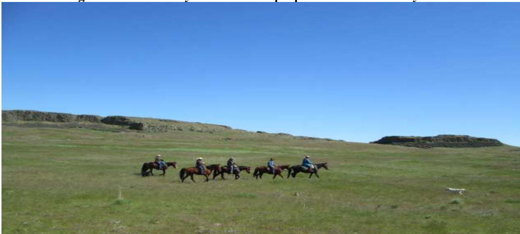
Photo below: Group of riders cover ground on Escure Ranch Ride. Photo at right shows riders crossing creek on Saturday ride. Some 25 people attended the 2-day event.