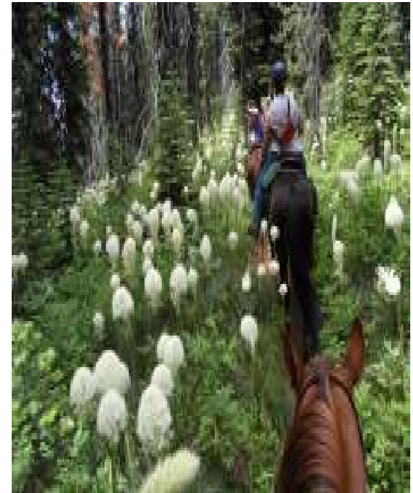
Photo above riding through the bear grass last summer.