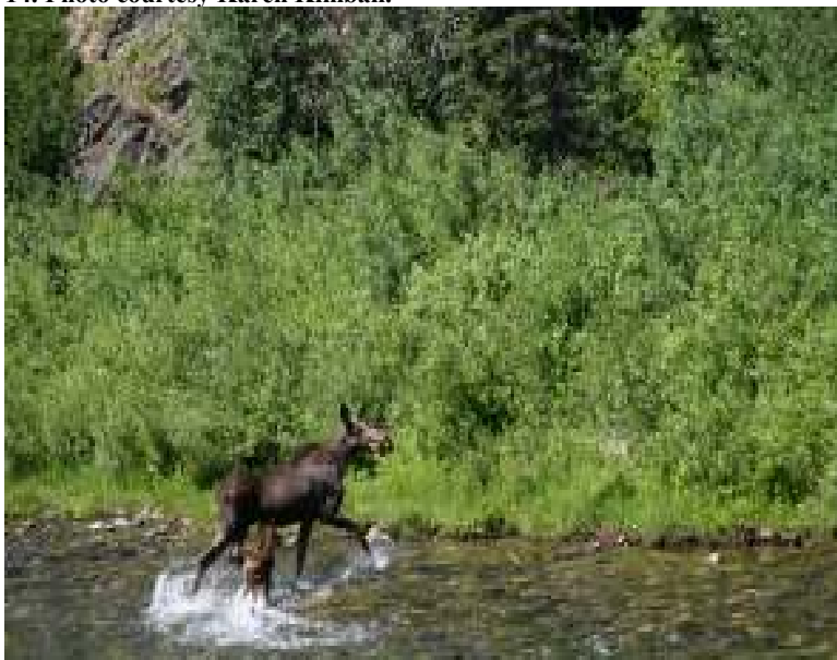
Photo: Mother Moose with calf near Red Ives trail clearing event July 12-14.

October 5 Annual Steak Ride. Members only. See information on pg. 3.